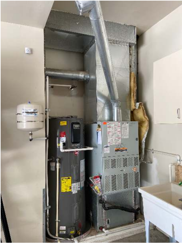
Old gas furnace that was inefficient and burnt fossil fuels