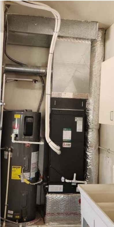
New Mitsubishi SVZ Air handler w variable speed blower motor