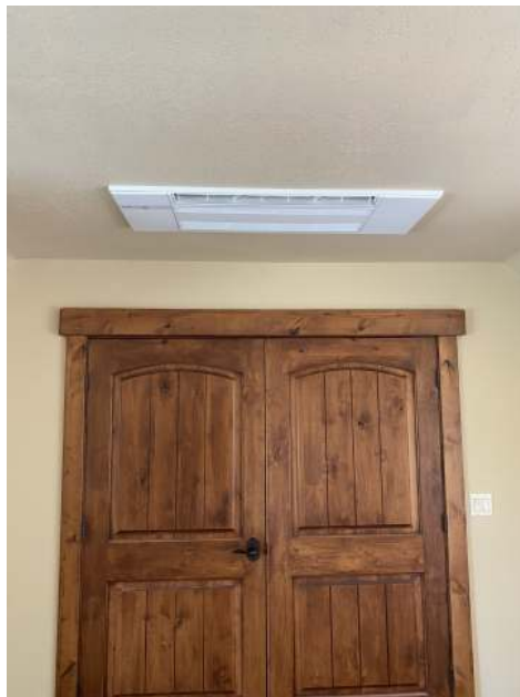
New Mitsubishi MLZ Ceiling Cassette to give the upstairs tenant a customized heating and cooling solution