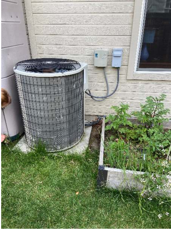
Old Outdoor Air Conditioning only unit that was not very efficient