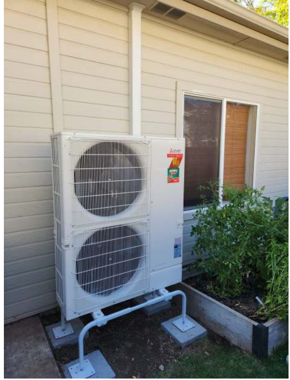
New Mitsubishi Outdoor Heat pump with Inverter Technology, heating capabilities down to -13F