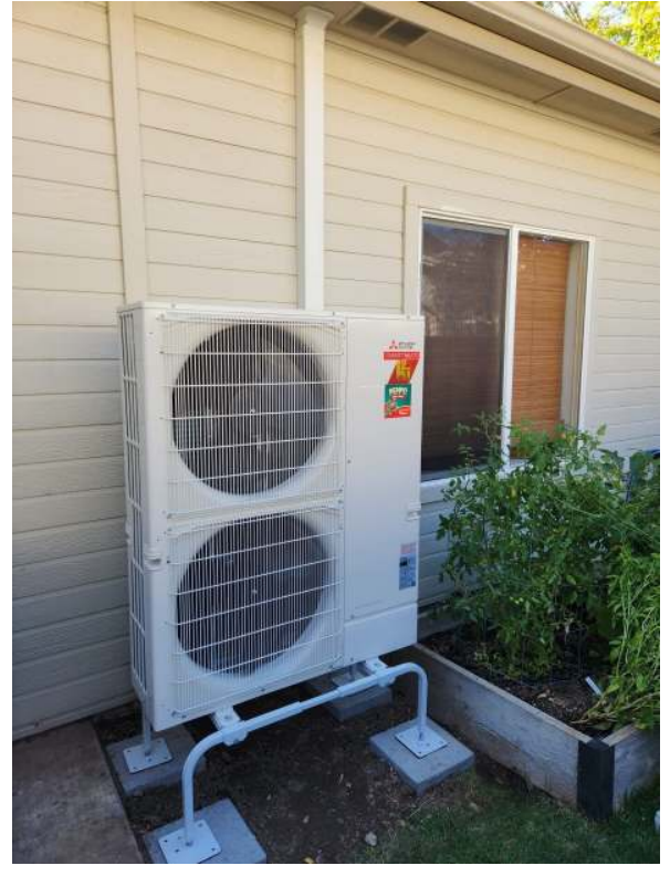
New Mitsubishi Outdoor Heat pump with Inverter Technology, heating capabilities down to -13F