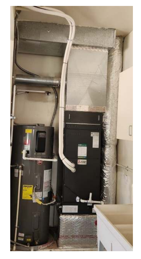
New Mitsubishi SVZ Air handler w variable speed blower motor